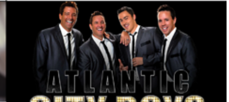
ATLANTIC CITY BOYS