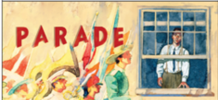
PARADE The story of love coming to life in a world ripped apart by prejudice...