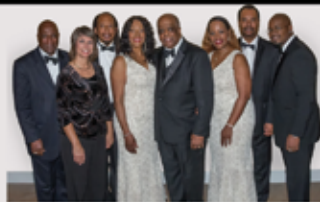
Motown Revue with Soul Sensations