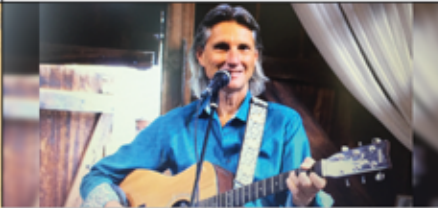
Those Were the Days: Folk Songs of the '60s