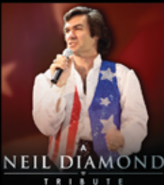
NEIL DIAMOND TRIBUTE