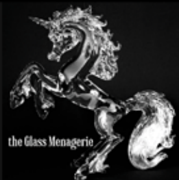
the Glass Menagerie