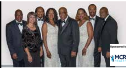
A Motown Revue with Soul Sensations