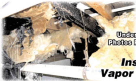
Underhome Photos Provided

Insulation Under Your Home Falling Down? Holes and Tears in Your Vapor /Moisture Barrier?